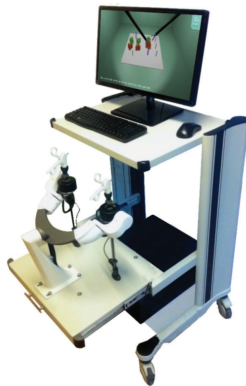
Figure 1. The SinaSim laparoscopic surgery simulator [10].

SinaSim laparoscopic surgery simulator is designed to fully reconstruct surgeon's posture during a laparoscopic surgery. To maximize the similarity of the training process and the surgery, standard laparoscopic instruments have been used. Each of these instruments have the same degrees of freedom of an instrument in real surgery. They are attached to each other with a crescent-shaped link which is fixed on a moving mounting. The mounting is placed on a trolley that carries the computer, monitor, mouse and keyboard. Figure 1 shows the SinaSim laparoscopic surgery trainer.