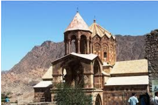
saint stepanous church

Day 1: we pick you up in border of iran Armenia (Nordooz border), going to Jolfa (its border city) we imagine u arrive early in morning, eating breakfast, start the visits saint stepanous church, shepherd church ,river of Aras (border of Armenia,nakhjovan,azerbayjan),caravansary of Khaje nazar ,cisiting this border city night hotel in jolfa.