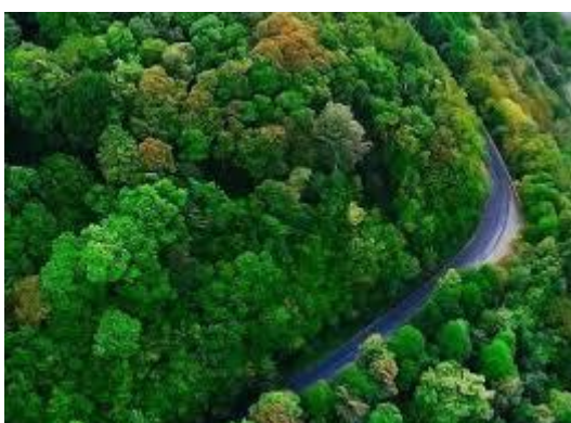
ASALEM –KHALKHAL ROAD

Day 5: check out going to small and local city of Khalkhal then we pass the unique road of Asalem Khalkhal, visiting city of Asalem (city in north of Iran)Masal(paradise of iran)night in typical house Masal.