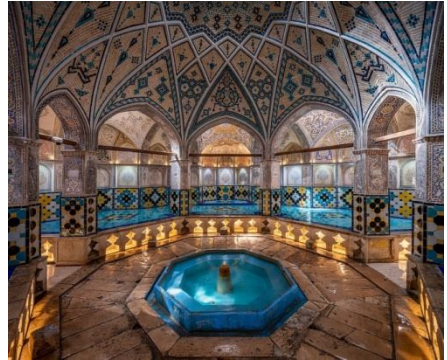
4 th april Day 2: Agha borog mousque and soultan Ahmad bath,lunch ,sialk archeological site,kashan bazaar night at kashan.

3<sup>rd</sup> april Day 1;Arriving at IKA Tehran: continue the way toward qom,visiting mausoleh of madam massoumeh and continue toward kashan,visit tabatabaee house night at boutic hotel in kashan.: