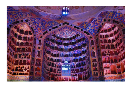
21 th april day19 check out toward Ardebil ,passing trough attractive scenery ,in arriving visit bazaar of Ardebil ,night at hotel in center of city .