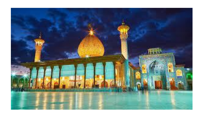
14 th april Day12: continue toward Persepolis and necropolis two visits very high ranking of iran ,visit nomade and their life and their tente.night at hotel in shiraz.