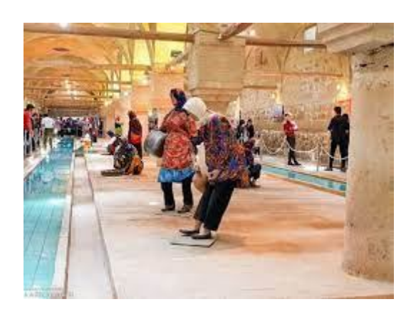
20 nd Day18: visiting lundry meuseum, meuseum of salty mens , bazaar of zanjan night at traditional hotel., 18 april