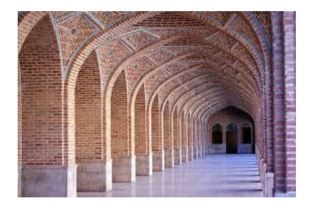
22 nd april day 20 :visit shirin of shekh saf ardebili ,which is classified in UNESCO.after kunch take a road to Tabriz ,evening going to el guli ,night at hotel in Tabriz