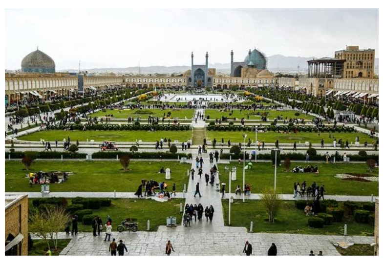
13 march ,day 4: Visiting atigh mosque ,Armenian traditional restaurant having local Isfahan_armenian food, visiting cathedral vank,Armenian area,gallery of handy crafts , and khajoo bridge night at hotel