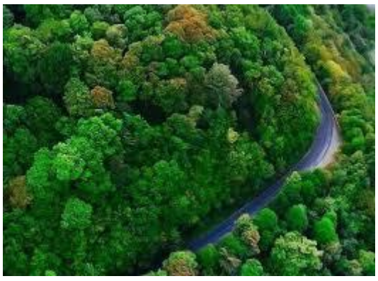
ASALEM -KHALKHAL ROAD

Day 5: check out going to small and local city of Khalkhal then we pass the unique road of Asalem Khalkhal, visiting city of Asalem (city in north of Iran)Masal(paradise of iran)night in typical house Masal.