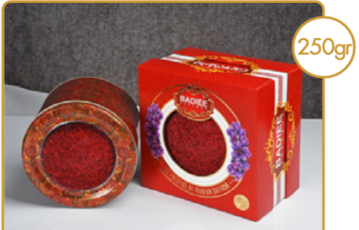
Box Special Supernegin