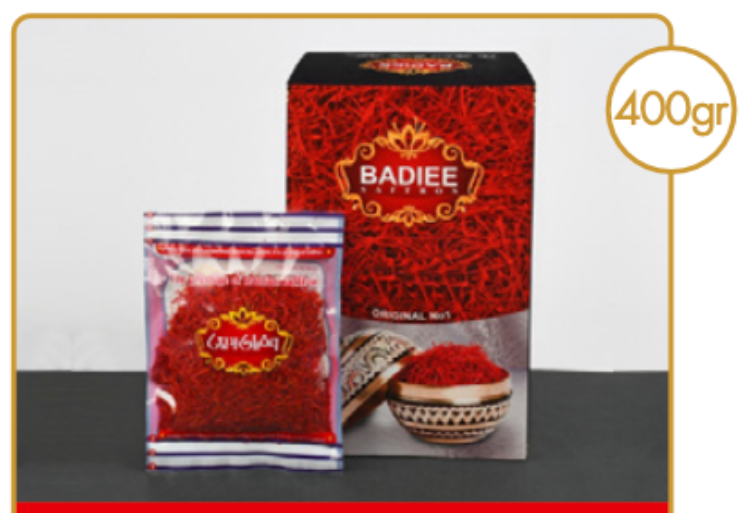
Plastic Warp (16×25)